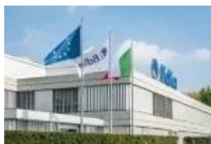
Fidia_outdoor_logo and flags