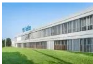
Fidia_outdoor_logo and façade